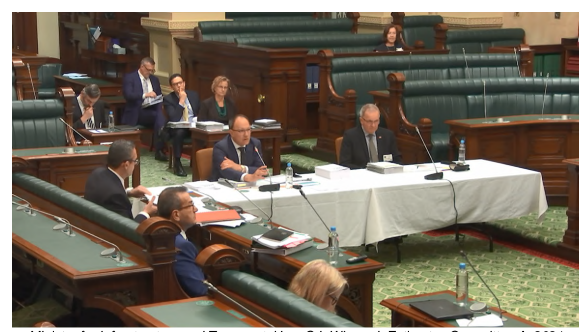
Minister for Infrastructure and Transport, Hon. C L Wingard, Estimates Committee A, 2021

The first Estimates Committees in South Australia were conducted in 1980. Since 1980, the Estimates Committees have become an important feature of the annual parliamentary calendar in the weeks following the introduction of the Appropriation Bill.