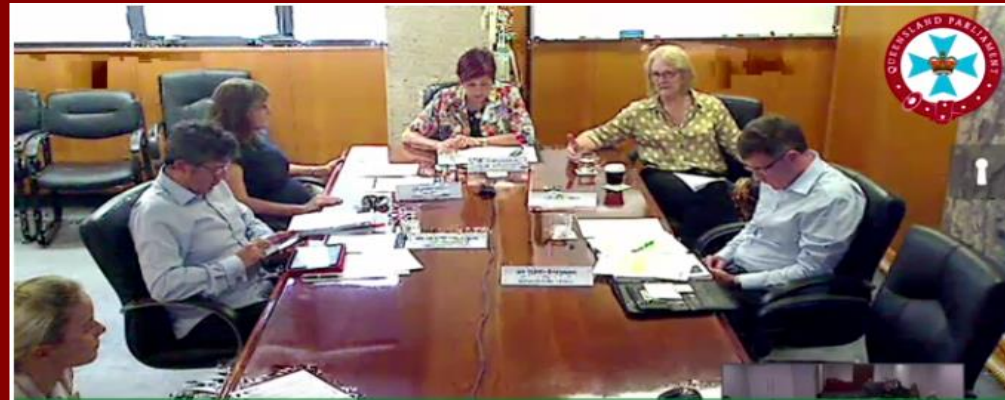
Economics and Governance Committee - Public hearing Local Government Electoral (Implementing Stage 2 of... Commencing 1.00 pm to 4.45 pm

Economics and Governance Committee Public hearing - Local Government Electoral (Implementing Stage 2 of Belcarra) and Other Legislation Amendment Bill 2019 - via videoconference with Townsville (27/5/2019)