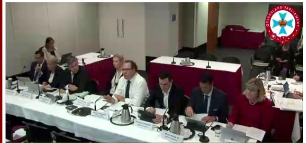
Economics and Governance Committee - Public hearing Local Government Electoral (Implementing Stage 2 of... Commencing 1.00 pm to 4.45 pm

Economics and Governance Committee Public hearing - Local Government Electoral (Implementing Stage 2 of Belcarra) and Other Legislation Amendment Bill 2019 - via videoconference with Townsville (27/5/2019)